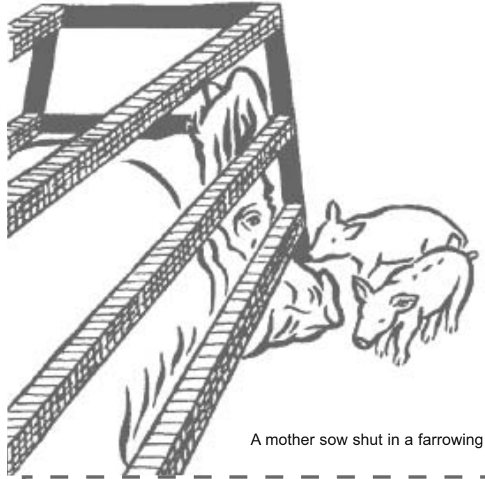
A mother sow shut in a farrowing crate

Animals can be more intelligent than newborn human infants. Babies should have rights; so should animals.