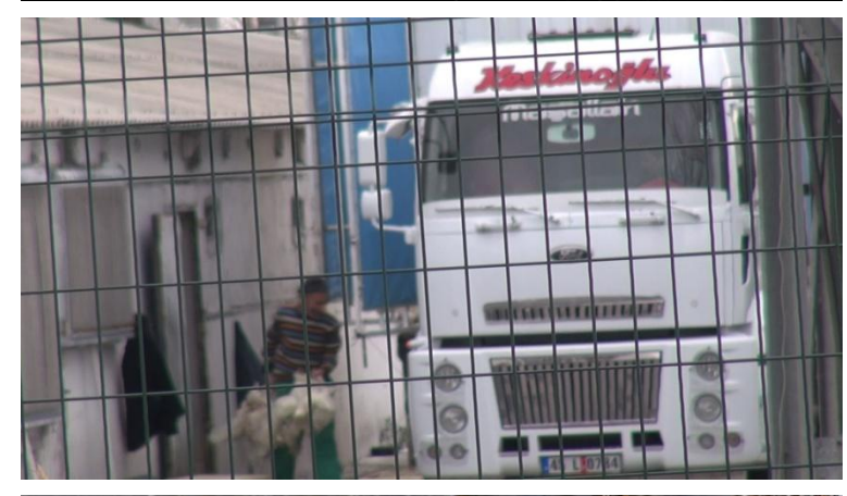
At another shed, chickens are loaded directly into the lorry by hand in large handfuls. In the supporting documents provided to the EBRD, the issue of carrying large groups of birds suspended by their legs was noted as a particular welfare concern, yet despite funding, still continues.