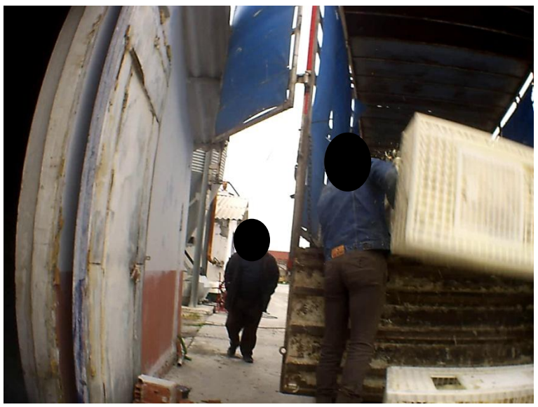
A crate of live chickens falls off the back of the lorry tailgate – just one of several to fall while filming.