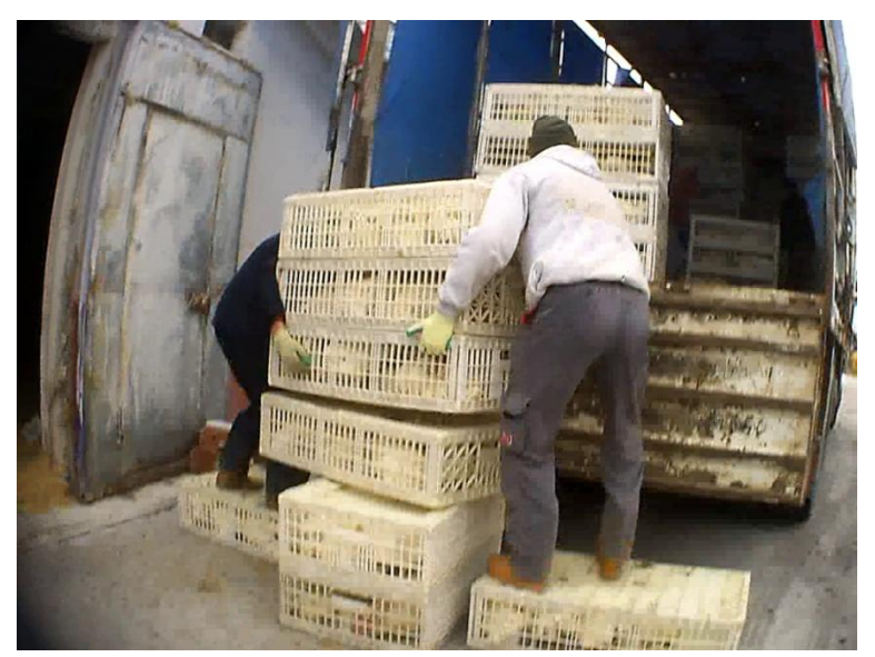
Throughout filming, the workers used four crates of live birds as a step to load other crates.