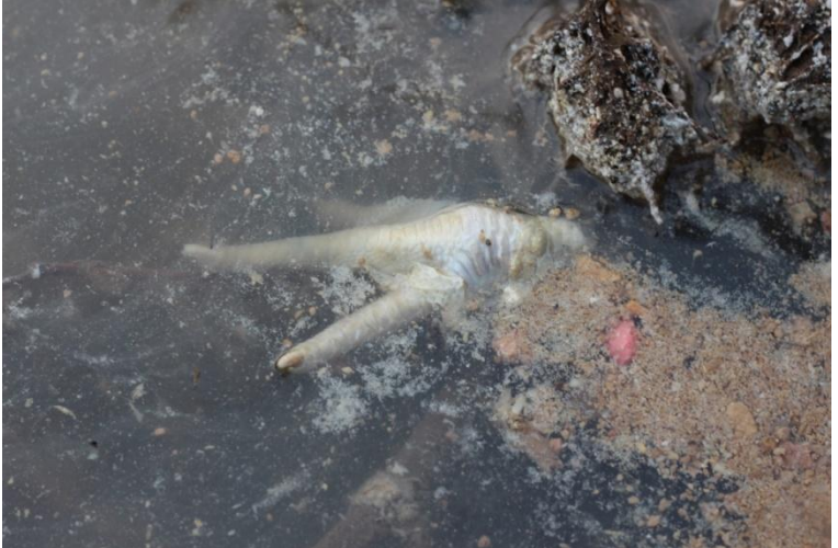
Very close to the Keskinoğlu processing plant, chicken feet were noted floating in Gorduk Creek. The plant discharges "treated wastewater" to this river.