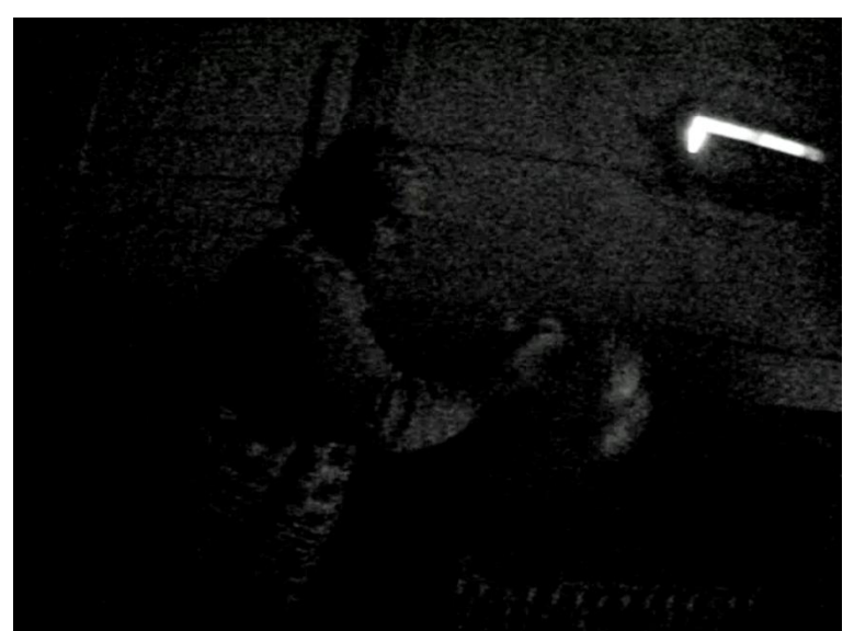
We document one catcher throwing birds violently into crates, resulting in loud vocalisations from the birds.