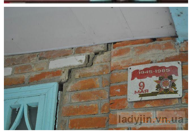
Cracks have appeared in almost every house in Olyanytsva's main street since MHP began expansion of its Vinnitsa complex. Residents blame heavy lorry traffic.