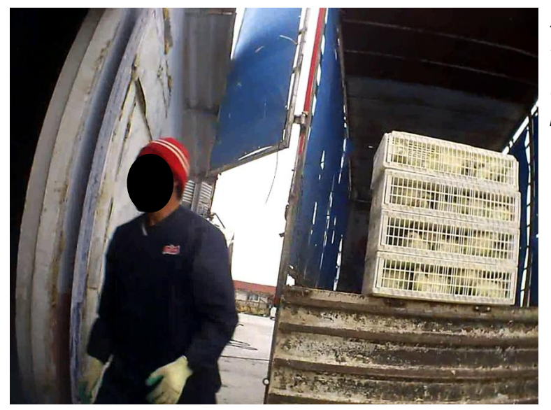
A worker smokes a cigarette while he loads up the chickens. A clear fire risk when working in broiler chicken sheds where litter is present.