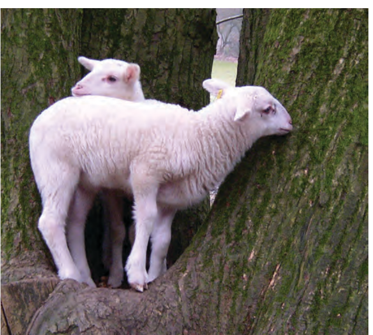
Young animals enjoy playing