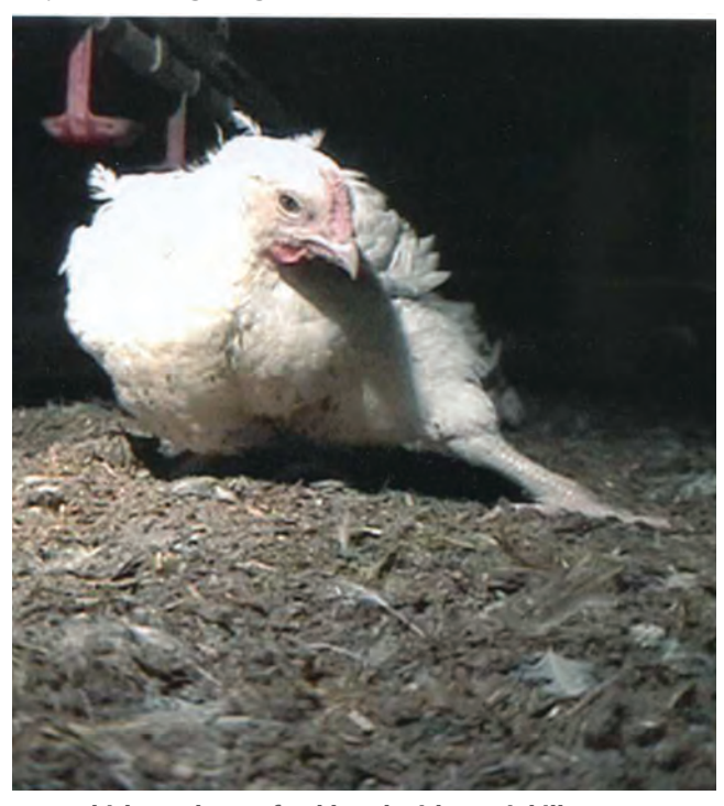
Lame chickens choose feed laced with a painkiller

Animal behaviour experts use a range of indicators to judge whether an animal is in pain. They look at how the animals behave, whether they try to avoid using an injured limb, their cries, changes of mood, unresponsiveness, and their reaction to pain relieving drugs.