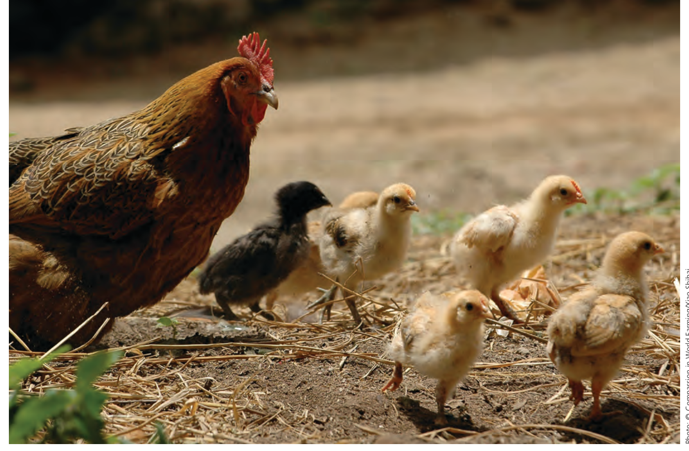
PROGRESS AND ALTERNATIVES