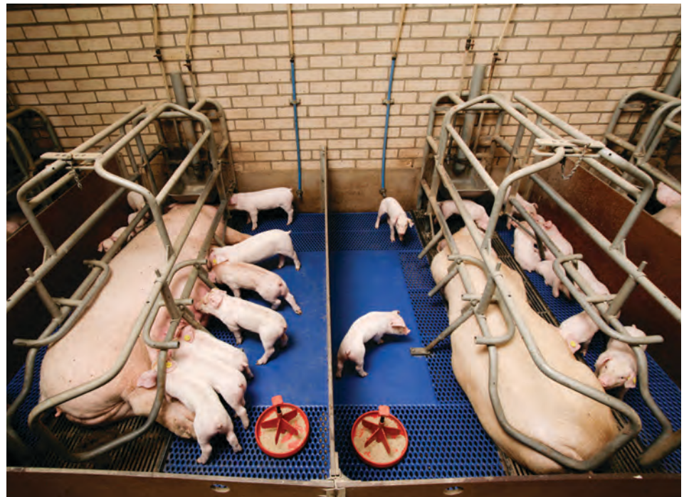
These sows in farrowing crates were unable to make nests for their piglets and cannot nurture them as they may want to

Before they give birth, sows are moved to farrowing crates, which