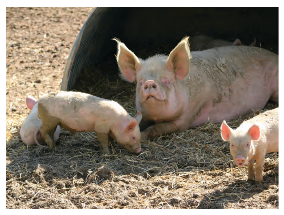
Free-range sows can nurture their piglets

A pregnant sow may walk 5-10 kilometers to find a safe site where she will build a nest of leaves and branches, in which she will give birth and protect her piglets. The piglets are gradually weaned by around 17 weeks but may stay with their mother till sexual maturity at 8-10 months. Pigs use their sensitive and versatile snouts for digging and foraging and they have an acute sense of smell.