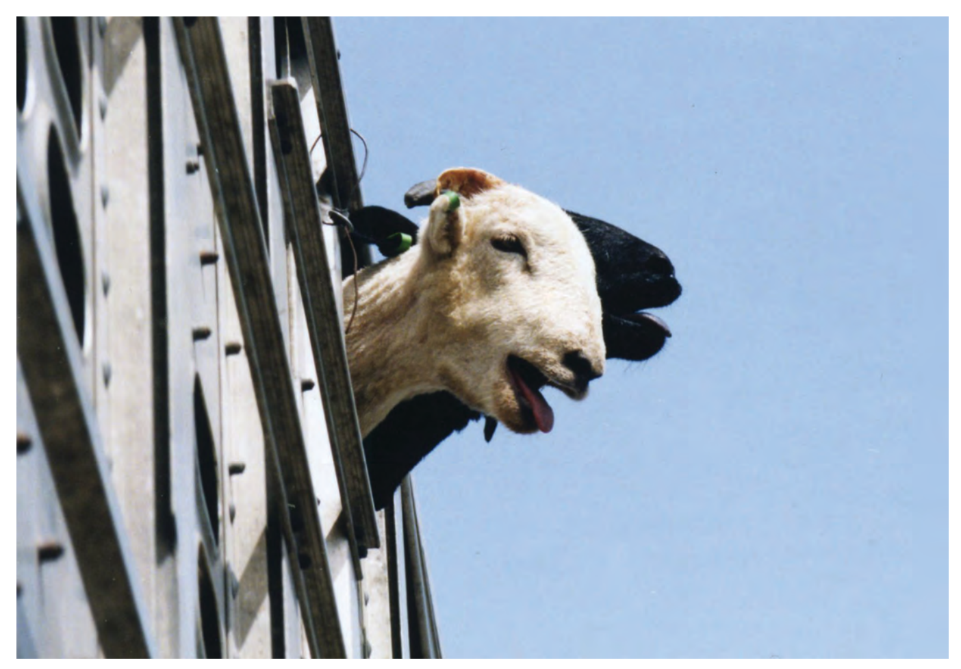
These panting sheep have been transported in hot weather which stresses them severely

Lambs are routinely tail-docked and castrated without pain-relieving drugs. Sheep and lambs may be transported very long distances. For example, millions sheep are sent by sea from Australia to the Middle East. Thousands of sheep die on the ships.