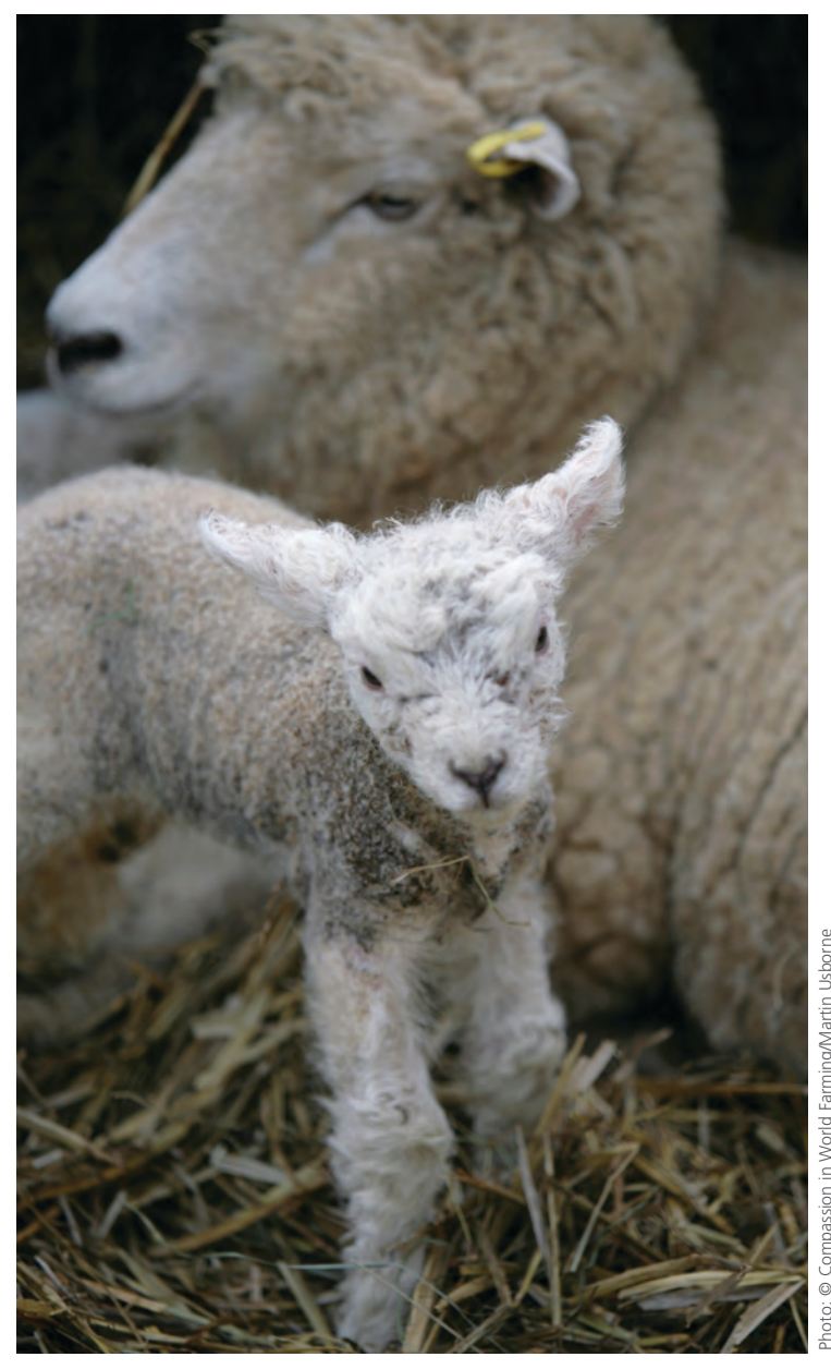
Farm animals have strong emotional bonds