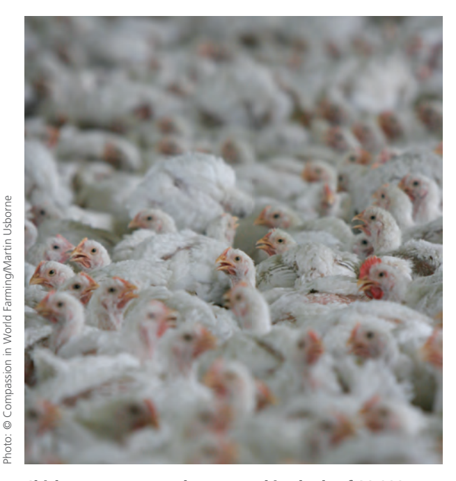
Chickens are commonly crammed in sheds of 20,000 or more birds