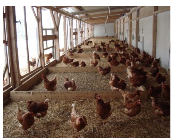
Ranging outside (left) and in wintergarden (right) encourages appropriate foraging behaviour and reduces the risk of injurious pecking. Wintergarden has separate dust-bathing and scratching areas with dust-boxes for dustbathing and straw to encourage foraging in scratching area.

Ranging is encouraged by a combination of wintergarden and outside range. The wintergarden provides a semi-outdoor range with the security of cover plus some protection from the elements of an Austrian winter. Pullets should already be used to ranging in the wintergarden and range from their experience during rear. On arrival at the farm, some grain is scattered in the wintergarden to further encourage its use. Good ranging behaviour encourages foraging birds away from the temptations of feather pecking as well as reducing the stocking density within the shed.