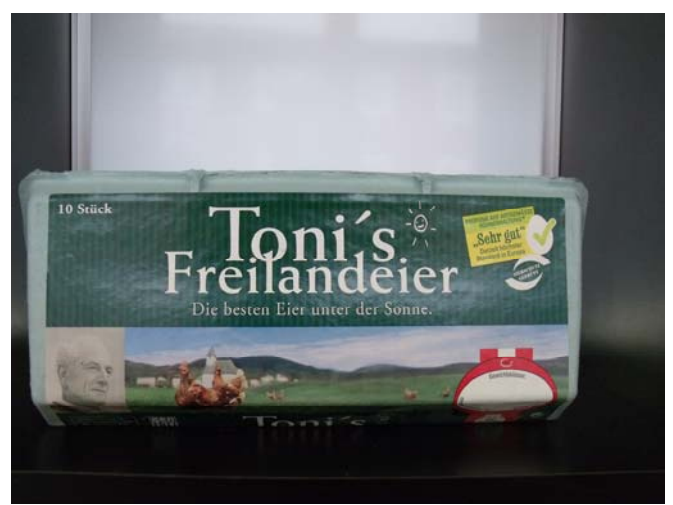
"The best eggs under the sun." Toni Hupmann is a pioneer of alternative Austrian production with a genius for marketing.

Toni's farm is an organic-certified free-range farm with houses containing no more than 3,000 birds in groups of no more than 1,500 (normally 600, only in one flock larger groups). The birds have access to a 'winter garden' a week after placement in the farm, before being given full access to range in the following week. There have been no feather pecking problems in the last five years.