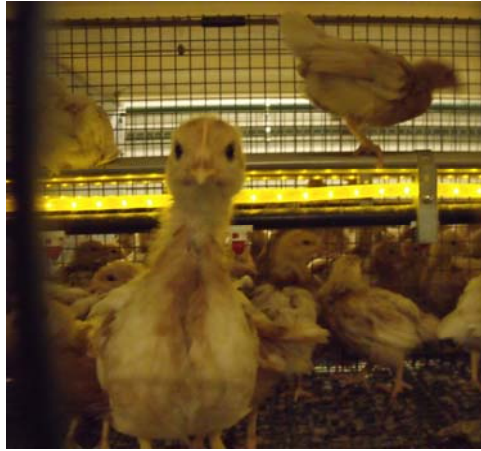
Multi-tier rearing system designed to prepare pullets for the laying house environment.

The farm rears 30,000 pullets in each flock for placement in various laying systems, including single- and multi-tier aviaries and free-range. The rearing house is newly furnished with a multi-tier rearing system that 'prepares pullets for later laying installations' by giving them experience of perches and encouraging them to move around.