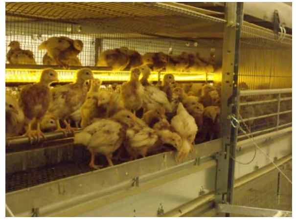
3-week old pullets in the middle tier of the rearing system. Nearly all Austrian pullets are reared in multi-tier systems which prepare them to range on arrival at the laying houses.

Rearing systems must prepare pullets for life in the laying house, in particular to ensure that birds actively use all parts of the house on their arrival. Nearly all Austrian pullets are now reared in multi-tier row systems which include slats and aerial perches.