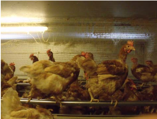
Birds on upper tier of multi-tier barn system. At 60 weeks there is some feather damage, but very little injurious pecking despite the obviously sharp beaks.

Farm Stumpf in Hartberg/Styria farm is a modern, newly built intensive layer farm housing 22,000 hens in four groups of 5500. Feed is produced on-site and eggs are weighed and sorted on-farm. Some eggs are sold directly.