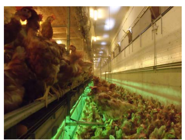
Multi-tier system showing scratching area.