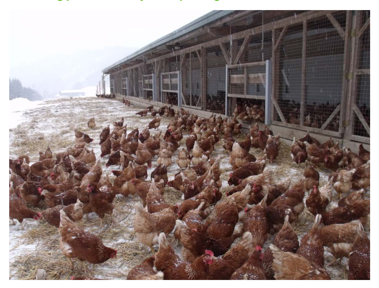
Toni's Freilandeier. Free-range Austrian hens in the snow with wintergarden in the background.

An account of the successful phasing out of beak trimming without increasing problems of injurious pecking