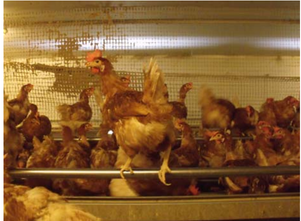
Lohmann-Brown hens in two systems: single-tier organic (left) and multi-tier barn (right). Aerial perches help protect resting birds from those which are foraging and reduce the effective stocking density in the foraging areas.

According to Dr Niebuhr, injurious pecking and feather pecking are multi-factorial in their origin. An integrated approach is required including: