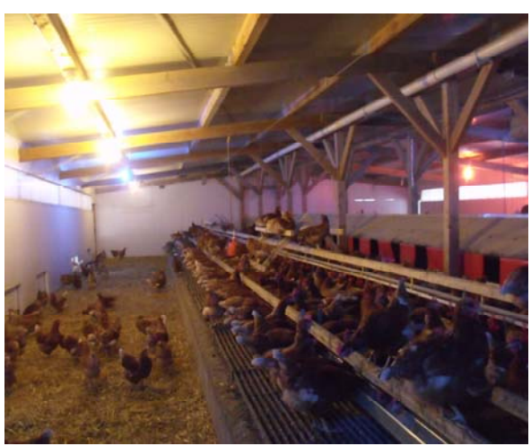
Free-range hens in the snow with wintergarden behind (left). Inside the shed (right) showing pop-holes to wintergarden, scratching area, single-tier A-frame perches and nesting boxes.

Toni's farm is an organic-certified free-range farm with houses containing no more than 3,000 birds in groups of no more than 1,500 (normally 600, only in one flock larger groups). The birds have access to a 'winter garden' a week after placement in the farm, before being given full access to range in the following week. There have been no feather pecking problems in the last five years.