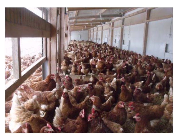
Organic system. Straw provides an excellent foraging medium to encourage positive natural behaviours in the scratching area. Wintergardens and range also help to occupy foraging birds and discourage feather pecking.

According to Dr Niebuhr, the greatest risk for injurious pecking is in organic systems where it can be harder to obtain feeds with reliable concentrations of protein and key amino-acids. This is a problem which could be addressed by the feed companies (eg by segregating sources of