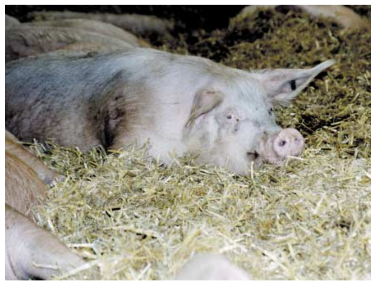
Contented sow on straw