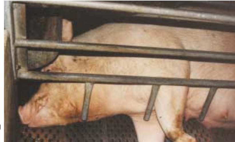
From sow stalls to farrowing crates - even motherhood is spent behind bars

In their report the SVC stressed that group housing systems can be designed and managed so as to prevent aggression. The key factors in this include: eliminating competition at feeding time; keeping the group as stable as possible (e.g. by bringing in new sows only when necessary); providing straw or some other manipulable material; avoiding overcrowding; and feeding bulkier food to prevent hunger. The SVC stressed that "systems such as this, which are working well in common practice, are available".