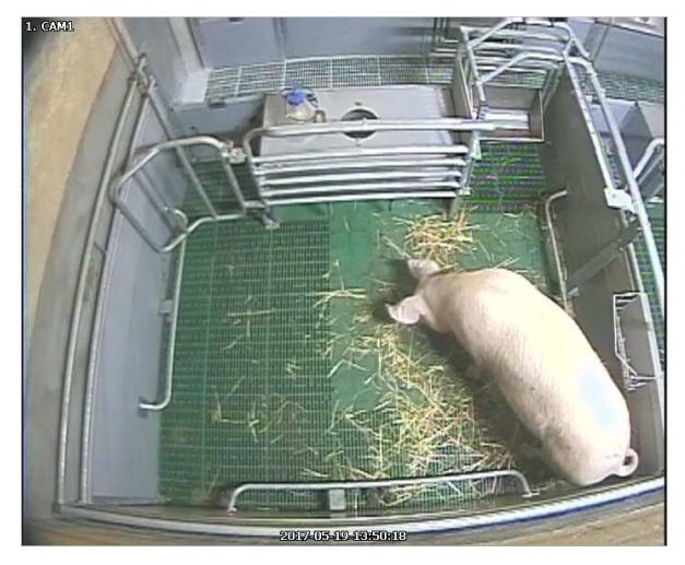
Figure 2 - Sow preforming nesting behaviour using straw

Each pen has 50% solid floor (part in the creep area and part in the pen to guarantee comfort to the sow) and 50% slatted floor. The floor is made of plastic square tiles which can be moved and re-arranged to identify the part of the pen where the solid floor works better for the sow and piglets (Figures 2 and 3). For example, if the solid floor gets wet, it may get slippery, increasing the risk of the sow laying down abruptly and crushing the piglets. The risk of crushing is reduced by the presence of farrowing bars in the lower part of the pen walls, which encourages the sow to lie down more slowly.