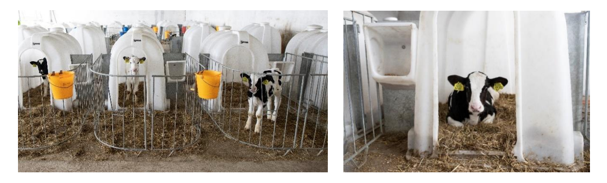
Figure 45: Individual pens in a Polish farm

Keeping calves in groups after the separation from their mother appears to provide some comfort, and pair-housed calves vocalise significantly less during this process than do individually housed calves<sup>387</sup>. Housing calves in groups allows them to perform their natural social behaviour and provides more space for play and general activity<sup>388</sup>.