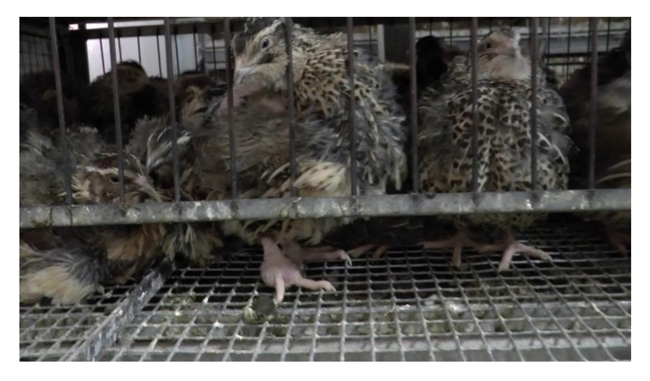
Figure 50: Caged quail, Italy.

may also be kept in cages. Caged quail are unable to perform most of their natural behavioural repertoire, including seeking cover, flying, foraging, dust bathing, and laying their eggs in a nest.