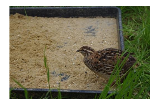
Figure 51: Quail are strongly motivated to dust bathe.

Quail will work for access to peat for dust bathing using a push-door apparatus and the level of work quail are willing to exert can exceed their own bodyweight, suggesting that the motivation to dust bathe is high.<sup>477</sup> Birds with prior experience of peat would work harder than naïve birds to access the peat but there was no difference in latency to reach the peat or latency to start dust bathing between experienced and naïve birds. As soon as naïve birds were given the opportunity to access peat, they worked for it.