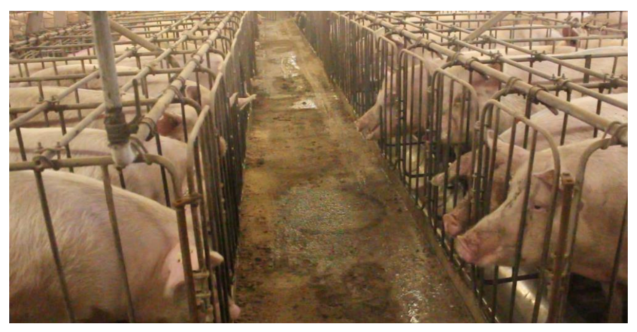
Figure 10: Sows in individual stalls, Italy.

It is well established that keeping sows in individual stalls (variously referred to as sow stalls, insemination stalls, gestation crates) inevitably causes poor welfare. Stalls severely restrict the movement of sows, to the extent that they have difficulty lying down and standing up.<sup>78</sup>