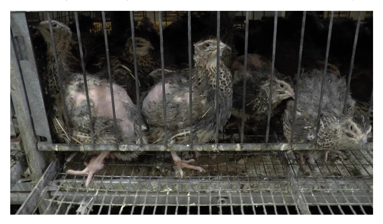
Figure 52: Caged quail, Italy. Lack of foraging opportunities leads to feather pecking.

Mohammed et al. , (2017)<sup>484</sup> compared different litter materials (sand, dried mud, sawdust, wheat straw and rice straw) for quail. They recommend provision of sawdust bedding material for quail due to a higher incidence of most maintenance behaviours (eating, crouching, huddling, sitting, idling and preening), better performance and improved welfare indicators (lower frequency of feather pecking / better plumage score, no feet or locomotor problems, and lower mortality).