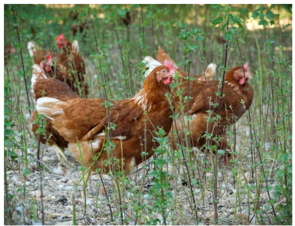
Figure 9: Organic system, France.

Good training and the dissemination of best practice is essential. The new DG Santé Pilot Project on Best Practices for Alternative Egg Production Systems has the potential to play an important role in facilitating the move from cages to well-run alternatives.