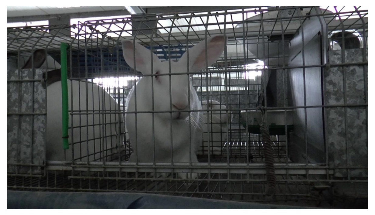
Figure 28: Breeding rabbits kept in isolation, Greece. Wire floors lead to sore hocks which EFSA states are "likely to be very painful" and "a cause of chronic suffering".

"Lack of social contact is a serious deprivation for a rabbit, so the welfare of those kept in social isolation will be poor."