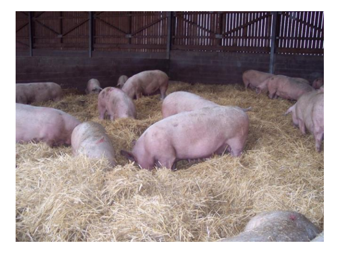
Figure 18: Giving group-housed sows enough space and straw provides fibrous food, foraging opportunities and bedding and therefore minimises aggression.

Feeding high-fibre diets to sows reduces feeding motivation, oral stereotypies and general restlessness and aggression.<sup>129</sup> O'Connell (2007)<sup>130</sup> found that provision of grass silage improved the welfare of newly-introduced sows in large dynamic groups. Feeding high-fibre diets to sows during gestation may also have benefits for piglet performance. Guillemet et al. (2007)<sup>131</sup> found that piglets from sows fed high-fibre diets during gestation showed improved growth rates during their first week of life and tended to be heavier at weaning. Feeding high-fibre diets can enable sows to be fed ad libitum whilst controlling nutrient intake; in group housing systems where sows are fed together, ad libitum feeding can solve problems of aggression caused by competition for feed and of variation in