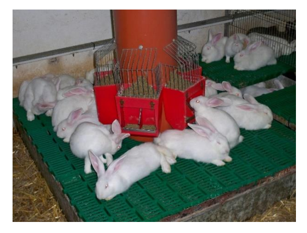
Figure 33: Higher-welfare indoor floor pen system, Austria. A bedded hiding area is underneath the raised platform.