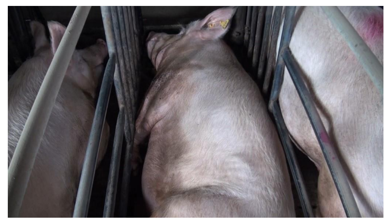
Figure 11: Stalls severely restrict the movement of sows, to the extent that they have difficulty lying down and standing up.

Confined sows show increased levels of stereotypies (abnormal repetitive behaviour), urinary tract infections, unresolved aggression, and inactivity associated with unresponsiveness (suggesting that sows may be depressed in the clinical sense), reduced muscular and bone strength and reduced cardiovascular fitness.<sup>79 80</sup>