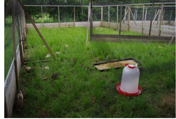
Figure 55: Free-range aviary system. Provides opportunities for foraging, dust bathing and hiding. Tall flexible roof reduces damage when quail exhibit vertical flight escape behaviour.