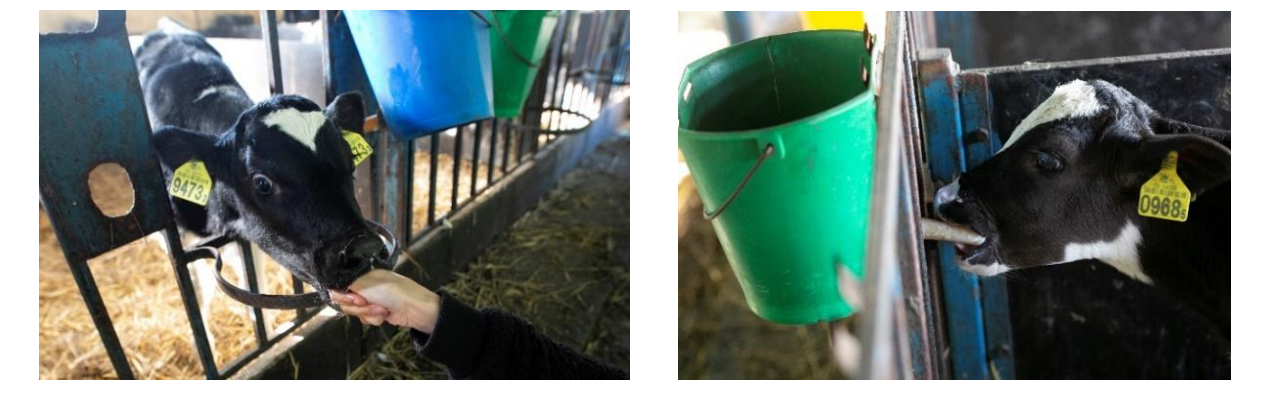
Figures 47 and 48: Calf suckling from a hand (left) and from a teat attached to an empty bucket (right). Since dairy calves are almost invariably separated from their mothers shortly after birth, their strong motivation to suckle is expressed on alternative objects or each other. Inappropriate feeding regimes also cause hunger, which increases inappropriate sucking behaviour.