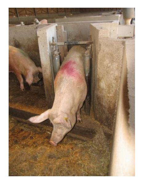
Figure 17: Sow emerging from electronic feeding system.

Chronic hunger and lack of opportunities to express foraging and exploratory behaviour can also contribute to stress and aggression in sows. Restrictive feeding and lack of roughage and/or appropriate enrichment can lead to increased restlessness, stereotypies and aggression, a high prevalence of stomach ulcers and frustration in sows.<sup>125</sup> Restrictive feeding during early pregnancy, beyond the first few days after mating, may adversely affect embryo survival and maintenance of pregnancy.<sup>126</sup> Levels of feed restriction commonly used commercially result in persistent high feeding motivation and oral stereotypies in sows.<sup>127</sup> A Finnish study found that provision of roughage increased the likelihood of sows becoming pregnant.128