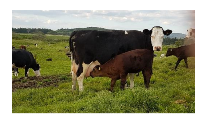
Figure 46: Calves naturally suckle from their mothers eight to twelve times per day. This organic dairy farm is going one stage further, maintaining contact between mother and calf as well as calves with each

Calves are also kept individually to prevent cross-sucking (includes navel-sucking), whereby calves suck on each other's navels and other body parts often leading to inflammation and hair loss<sup>431</sup>. In addition to the navel, they will also suck on each others' ears, mouth, scrotum or udderbase<sup>432</sup> and even a human finger or hand, if provided (see Figures 45 and 46). This detrimental behaviour is seen in calves reared artificially and not in calves reared by their mother; it is a redirected feeding behaviour<sup>433</sup>.