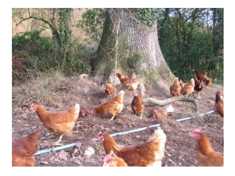
Figure 7: Hens foraging and dust bathing under the cover of a tree. Hens forage more widely if they have cover to give them a sense of security from predators. Foraging reduces the risk of feather pecking.

Scientists from the University of Bristol operating the Featherwel project identified 46 potential management strategies from the scientific literature to reduce the risk of injurious pecking. They found that the greater the number of management strategies employed, the lower the plumage damage, the level of severe feather pecking and the mortality<sup>54</sup>.