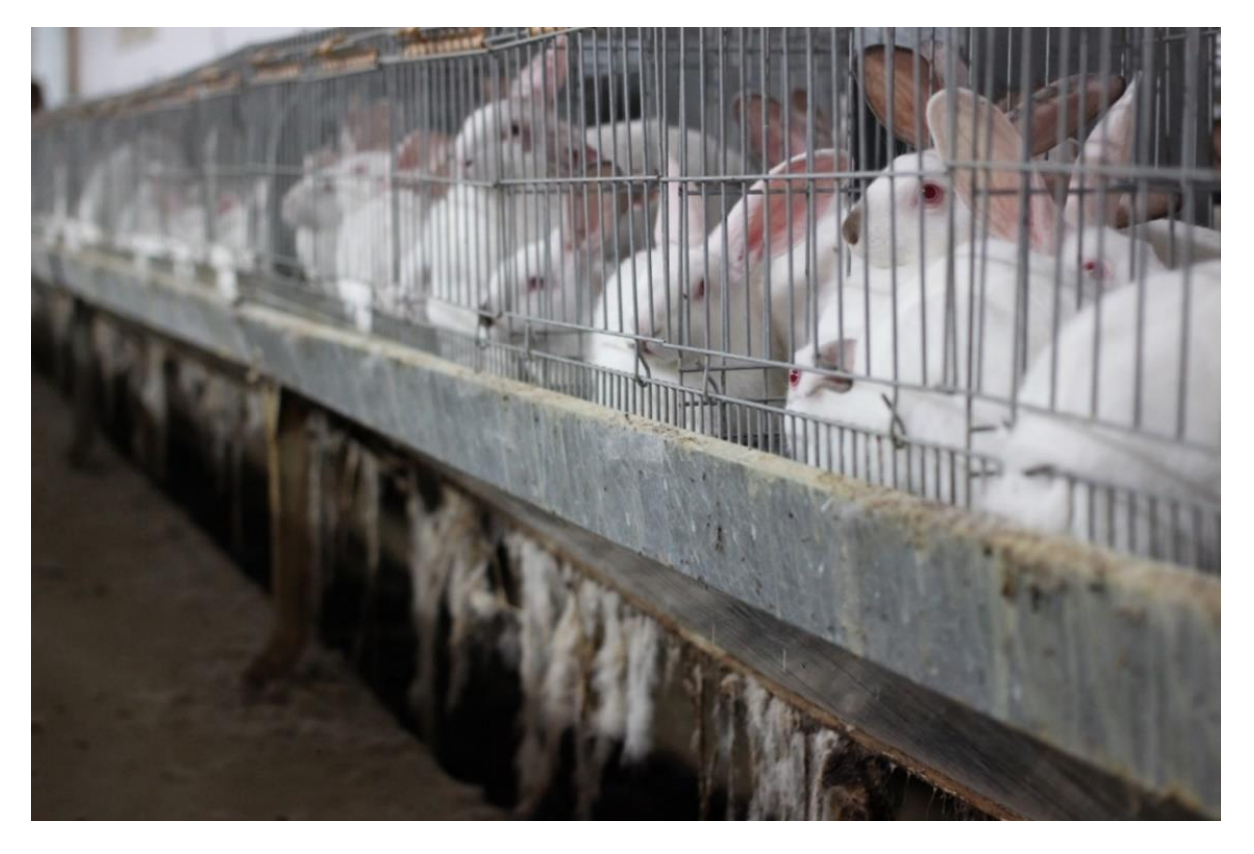
Figure 24: Conventional barren cages for growing (meat) rabbits.

V. Health, welfare and production of farmed rabbits in cage and non-cage systems