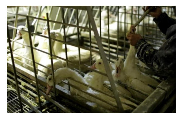
Figure 39: Gavage. The top of the cage is pulled down to trap the heads of the ducks so that they can be force-fed.