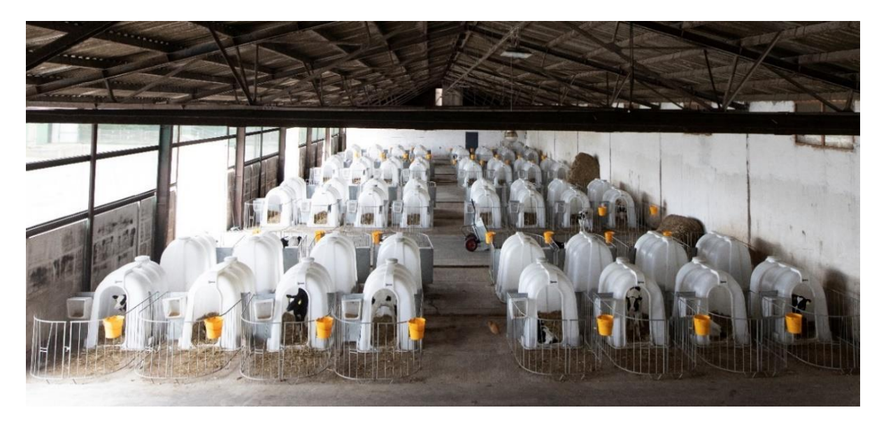
Figure 41: Calves housed in individual pens until 8 weeks of age, severely restricting natural behaviours including close physical contact, social interaction, play, and exercise.

Individual calf pens house calves singly with restricted social contact. Council Directive 2008/119/EC requires a calf pen to be as wide as the height of the calf (measured at the withers) and as long as the body length of the calf multiplied by 1.1. Calves are kept in this confinement for up to the first 8 weeks of their lives.