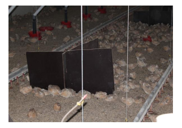
Figure 54: Meat quail are usually kept in cage-free barn systems, such as this one. However, in Italy, some meat quail are also kept in cages.

Birds in enriched aviaries exhibited a richer behavioural repertoire, including an increase in highlymotivated activities such as pecking, sand bathing,