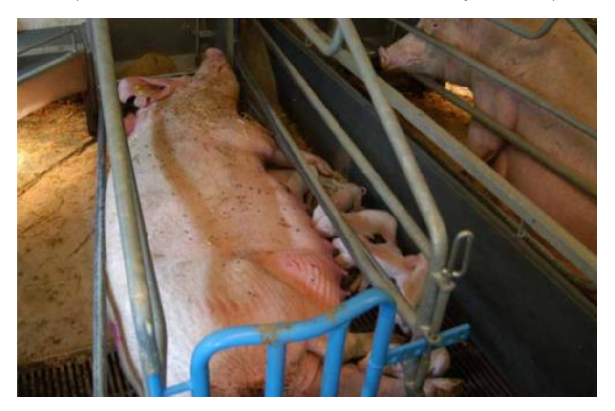
Figure 20: Photo of a common farrowing crate with space restriction. The picture illustrates problems with limited space for the piglets to suckle. The piglets in the picture are almost newborn. In addition, the space in length is too small resulting in the sow resting her head on the trough due to limited space in the length of the crate. <sup>153</sup>

As such, most, if not all, farrowing crates do not comply with Council Directive 2008/120/EC which requires that: "The accommodation for pigs must be constructed in such a way as to allow the animals to: — have access to a lying area physically and thermally comfortable as well as adequately drained and clean which allows all the animals to ... rest and get up normally...".<sup>152</sup>