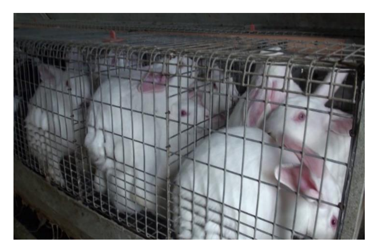
Figure 26: Growing (meat) rabbits, Italy. Insufficient space to lie, to rise up, to hide, let alone to exercise.