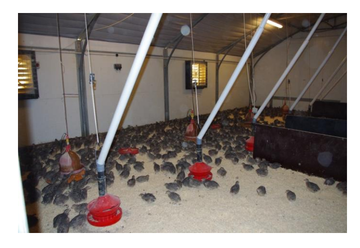
Figure 53: Laying quail in cage-free indoor barn system. Panels provide places to hide; litter provides foraging opportunities.

Nordi et al., (2012)^{485} compared the welfare of quail kept for egg-laying in battery cages (45 x 60 x 26.5cm; 8