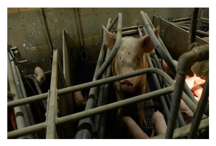
Figure 19: Sow in farrowing crate.

Farrowing crates confine sows within bars so that they cannot walk or turn around (see Figure 17). A crate typically measures 1.23m^2 ; the crate sits within a pen which houses the piglets but is unavailable to the sow: typical total pen size 3.6m^2 - 3.95m^2 .<sup>137,138</sup> The flooring is part or fully slatted and is usually positioned above a slurry pit.<sup>139</sup> Bedding is normally not provided for the sow.<sup>140</sup> Sows are generally put into a farrowing crate about a week prior to farrowing, until their piglets are weaned at about 4 weeks after farrowing.