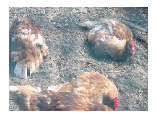
Figure 6: Dust-bathing behaviour requires space, solid ground, freedom from disturbance and suitable litter.

In the absence of proper litter and of sufficient space, most dust bathing is sham dust bathing<sup>44</sup>, taking place on the wire floor without substrate<sup>45</sup>.