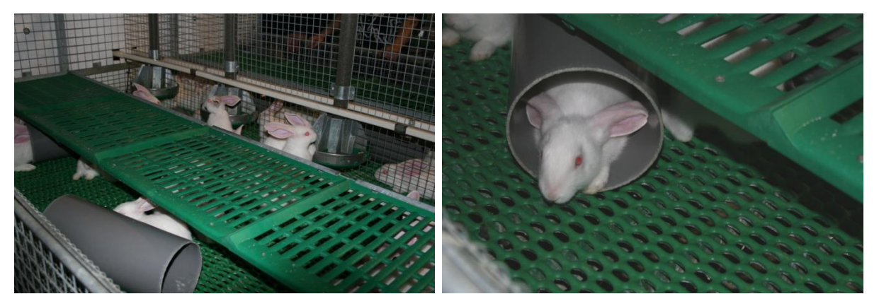
Figures 29 and 30: Park system (elevated pen) developed to meet the new requirements of Belgian law, which requires a minimum space, maximum stocking density plus the provision of platforms, tubes, gnawing blocks and enrichment material such as hay or straw. Park systems are widely in use throughout Belgium.

A variety of non-cage systems exist, including elevated pens (also termed park systems), floor pens, and outdoor free-range or organic systems. Elevated pen systems, designed to meet the requirements of Belgian legislation banning cage systems for growing rabbits, typically measure 212cm x 120cm (providing a total floor area of at least 800cm<sup>2</sup> per growing rabbit) and have an open top (no height restriction) – see figures 27 and 28). Belgian law also requires the provision of platforms, tunnels, gnawing equipment and more comfortable lying areas. Enrichment materials such as a block of wood, straw, hay, carrots and other suitable substrates must be provided.<sup>288</sup>