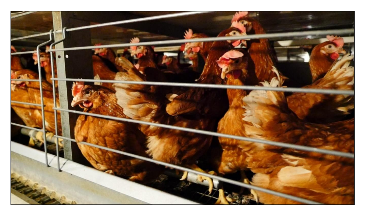
Figure 3: Enriched cage, EU.

To feel safe at night, birds need perches higher still. Running, jumping and flying – all common and healthy behaviours of hens – are simply not possible.