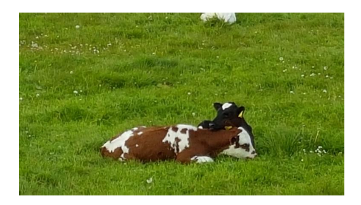
Figure 42: Calves commonly choose to lie together in full body contact. Relationships formed like this can last for years.

Calves naturally form relationships shortly after birth, with their mother and with their peers, which can last for years<sup>378,379</sup>. The mother provides milk for her calf. Whilst their mothers move off to graze, recently-born calves often lie together in pairs or groups. They commonly lie in close body contact with each other (see Figures 40 and 41). Calves also perform social play together from 2 weeks of age (see Figure 42), and perform locomotor play in parallel with each other even earlier than this<sup>380,381</sup>.