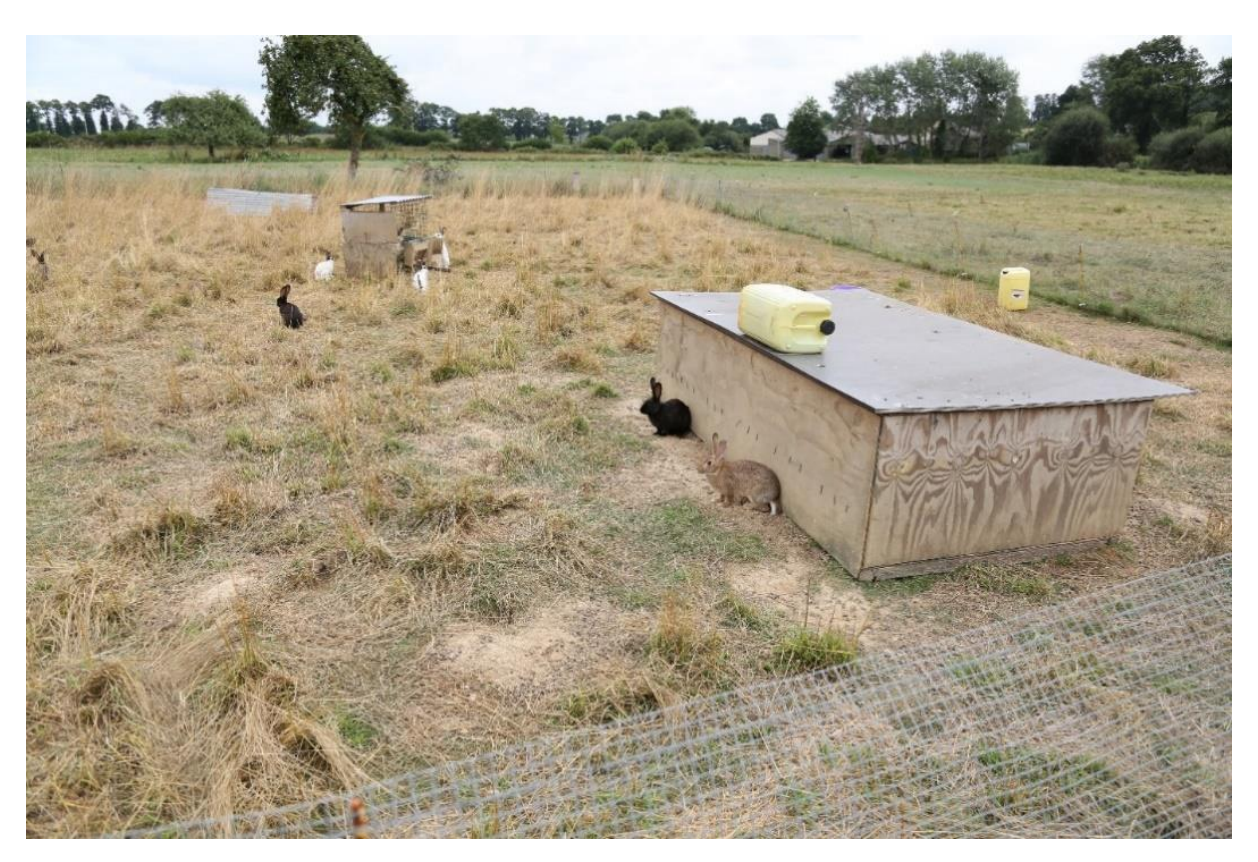
Figure 35: Free-range rabbit farm, France.

Non-cage systems (mostly elevated pens (parks) but also barn systems, floor pens, free-range and organic systems) are being used successfully for growing rabbits in several European countries, and a number of countries have introduced legislation to improve housing systems for rabbits.