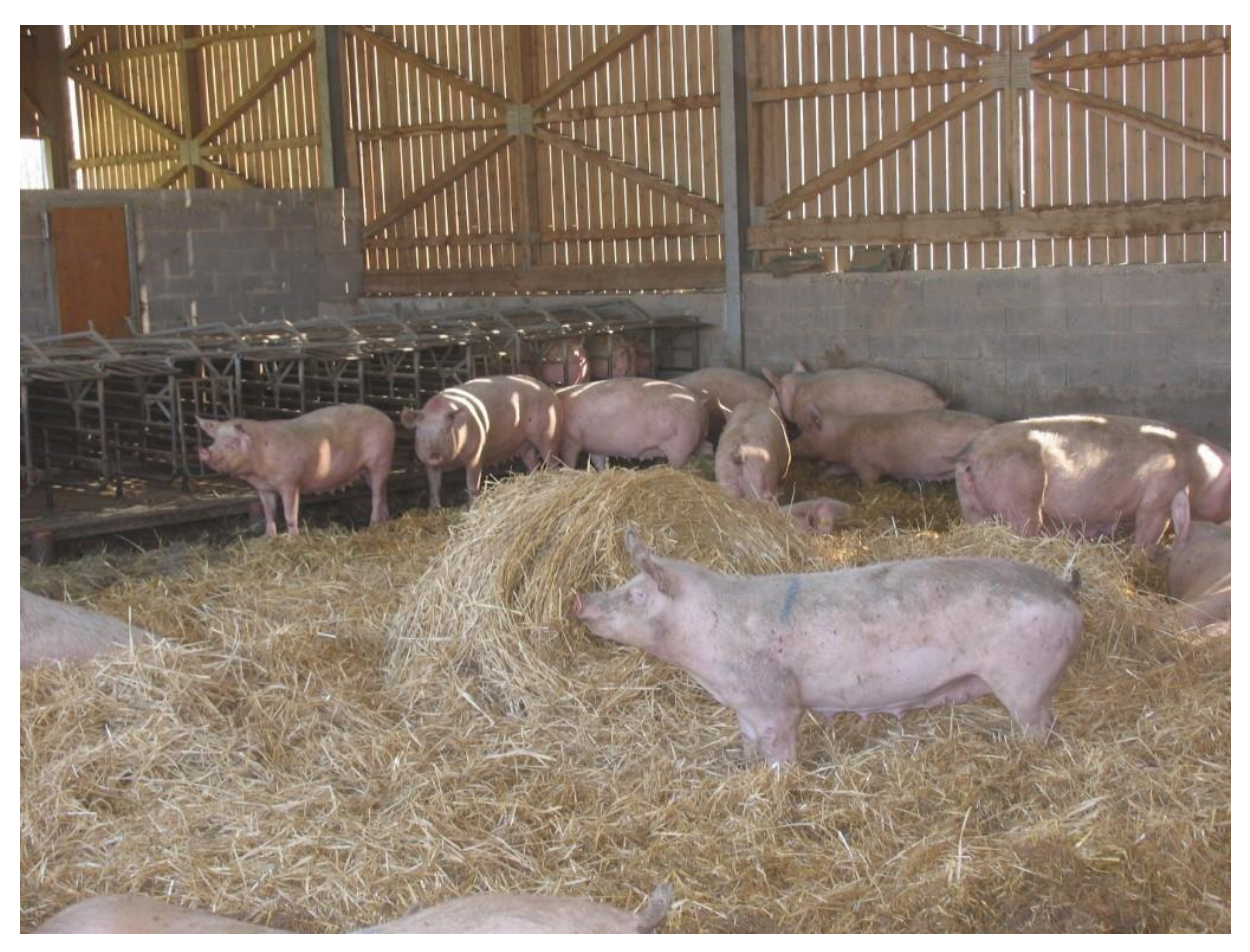
Figure 16: Group-housed sows with individual feeding stalls.

different social rank. Bates et al. (2003)<sup>123</sup> reported improved reproductive performance in sows group housed with electronic sow feeders (ESF) compared with sows housed individually in stalls. In the ESF system, a greater percentage of sows remained pregnant after initial service and farrowed a litter; and a greater percentage of sows returned to oestrus within 7 days of weaning compared with stall-housed sows. The design of ESF systems should take account of the need to minimise queuing and aggression at the entrance, for example by considering the number and location of feeders, and the distance from exit to re-entry.<sup>124</sup>