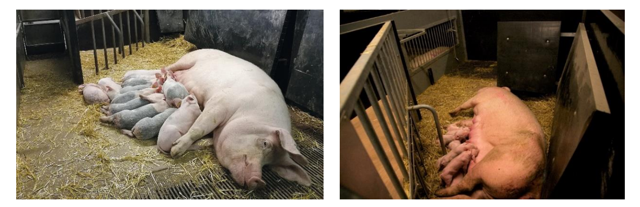
Figures 21 and 22: PigSAFE Designed free-farrowing pen.

An extensive review of data, comparing 12 existing indoor free-farrowing systems against conventional crates and outdoor systems, found that designed free-farrowing pens averaged the lowest total piglet mortality (16.6%), followed very closely by outdoor (17%) and that conventional farrowing crates had the highest overall total piglet mortality (18.3%).<sup>167</sup> Their standardised welfare index (which accounted for both sow and piglet welfare) revealed much greater welfare in designed pens (1.64) compared to conventional crates (0.95).