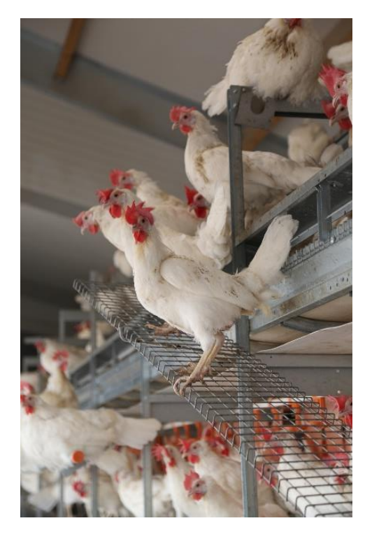
Figure 8: Ramps enable easy access between the tiers, reducing the risk of accidents that can lead to keel-bone damage.

Industry practice is improving and achieves better results than were reported ten years ago. Free-range specialists, Stonegate, report levels of keel-bone fracture around 50%, ranging from 30-70%. Noble Foods keep their pullets in multi-tier barns which build up bone and muscle strength, with ramps for easy access to the tiers, all to the same layout of the laying farm. This prepares pullets for the laying house, allowing them to navigate it better and reduce risk of collisions<sup>74</sup>. Many breeding companies now place increased emphasis on health and bone strength. All of this should further reduce levels of bone breakage.