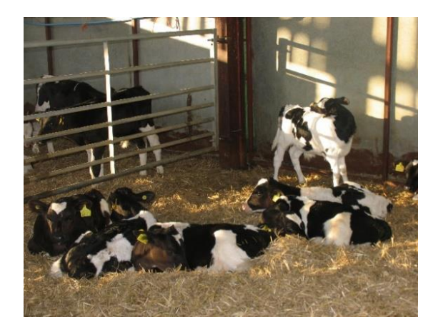
Figure 43: Research shows calves desire full rather than partial contact. Calves kept in groups, whether on pasture or housed on straw, commonly choose to lie close to