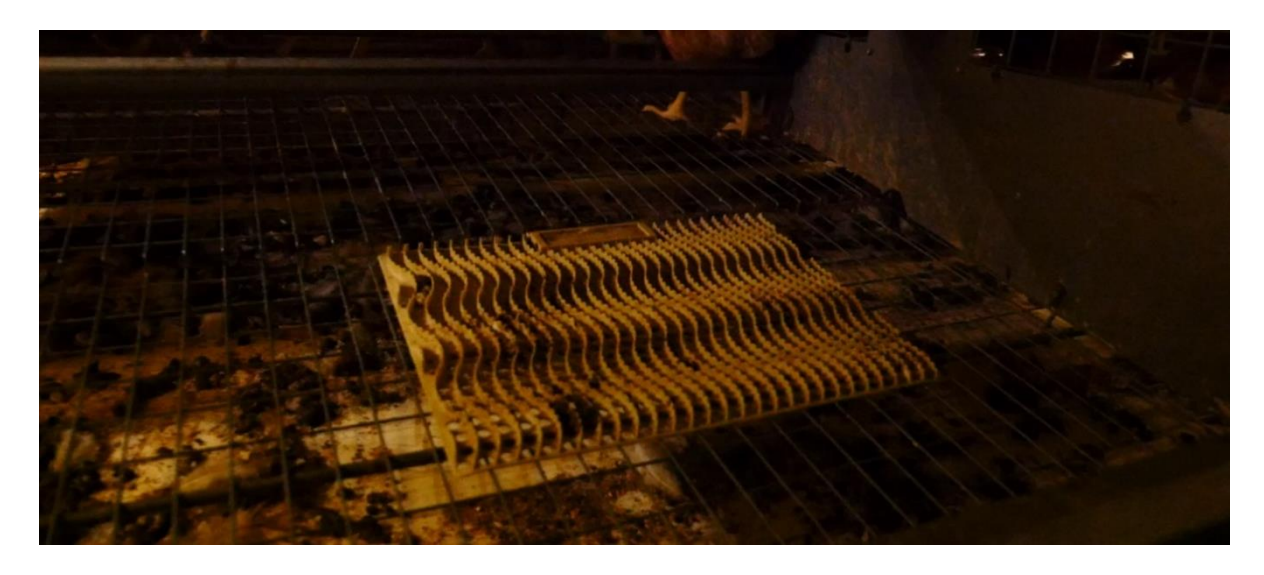
Figure 5: Scratching platform provided for foraging on with a small piece of sandpaper for clawhealth. There is no minimum area required for the scratching platform. It is supposed to be supplied with substrate to encourage scratching, but no minimum quantity is specified and in this case, it would fall through if provided. Substrates which are sometimes provided are generally not suitable for dust bathing. As a result, these behaviours are not effectively provided for and nearly all dust bathing is sham dust bathing.