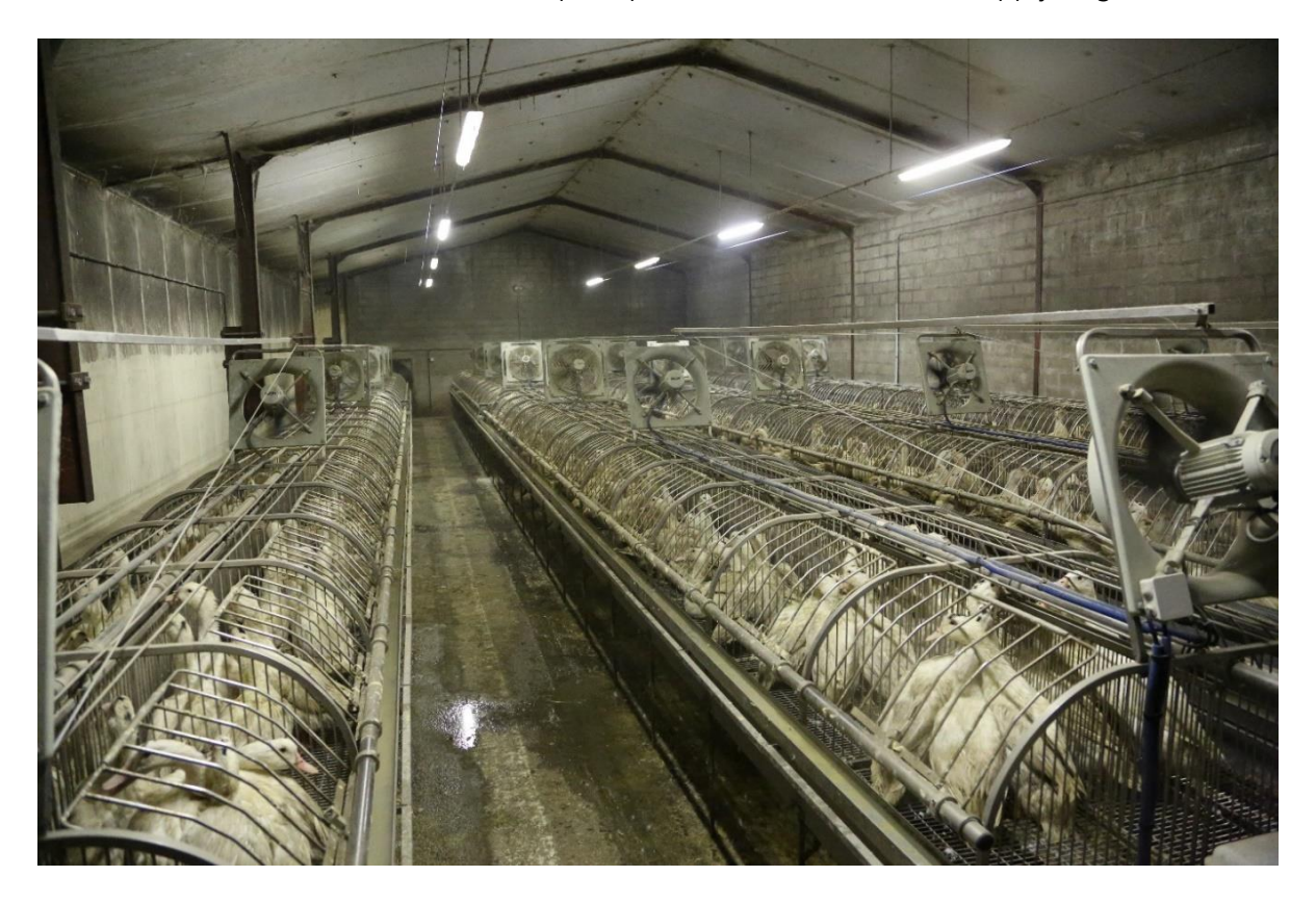
Figure 38: Ducks closely confined in barren group cages during force-feeding period

According to industry figures, nearly 95% of EU production of foie gras in 2019 came from ducks<sup>321</sup>; in France, the figure was nearly 99%<sup>322</sup>. This briefing will mainly concentrate on the welfare of ducks, but most of the same principles are considered also to apply to geese.