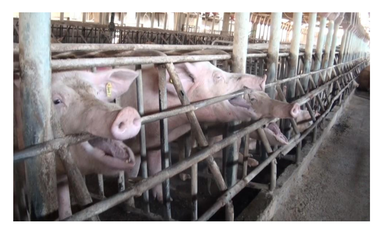
Figure 12: The stress of being caged in individual stalls leads to repetitive behaviours such as bar biting.

Housing sows in stalls until four weeks after service exposes them to the same welfare hazards as confinement during the remaining gestation period, including frustration, stress and restricted movement.<sup>81</sup> Sows are highly active, restless and motivated for social contact during the preoestrus period (from around three to four days after weaning and the following four to five days); and during the two to three days of oestrus sows engage in high levels of social activity including sniffing, flank nosing and mounting other sows as well as standing in front of the boar if he is present; aggression is hardly ever observed during this period.<sup>82 83</sup> This activity is part of the natural oestrus behaviour of sows and when sows are confined during this period this strong motivation cannot be expressed.<sup>84</sup> The Animal Health and Welfare (AHAW) Panel of the European Food Safety Authority (EFSA) concludes: