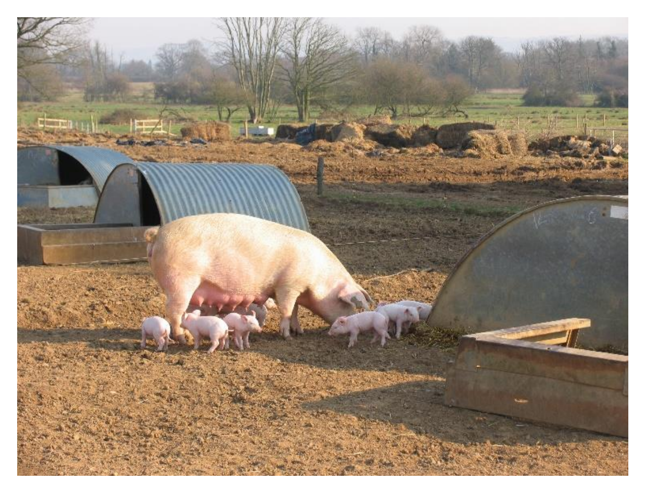
Figure 23: Free-range farrowing system.

Compared with indoor systems (crates and free-farrowing pens), outdoor systems require significantly less initial capital investment<sup>188</sup>, are quicker to set up, are less of a financial risk and present the lowest cost of production.<sup>189</sup> Outdoor farrowing has been referred to as 'the gold standard for facilitating high welfare, whilst being economically efficient'.<sup>190</sup>