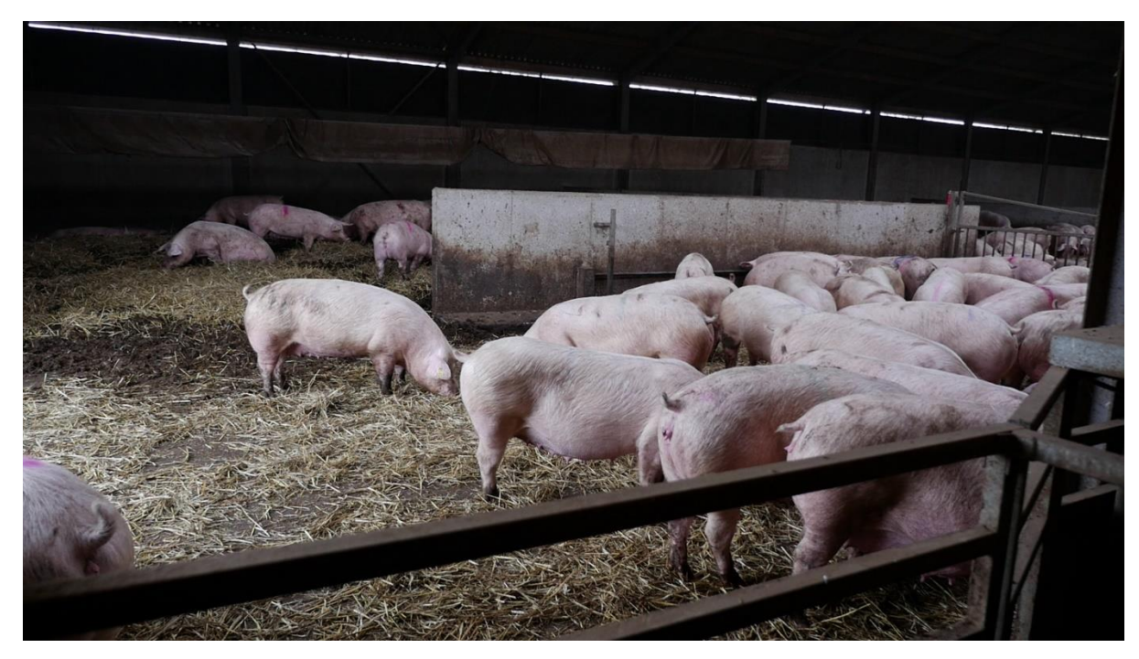
Figure 15: Sufficient space, straw and visual barriers minimise aggression.

Numerous studies report reduced aggression and injuries in group-housed sows with increasing space allowance.<sup>113</sup> <sup>114</sup> <sup>115</sup> <sup>116</sup> Provision of sufficient space is especially important during mixing, when the use of specialised mixing pens can provide additional space and barriers to allow subordinate sows to escape aggressors. Where sows are kept in large groups, aggression at mixing can be reduced by pre-mixing small groups of sows prior to their introduction together to the larger group.<sup>117</sup>