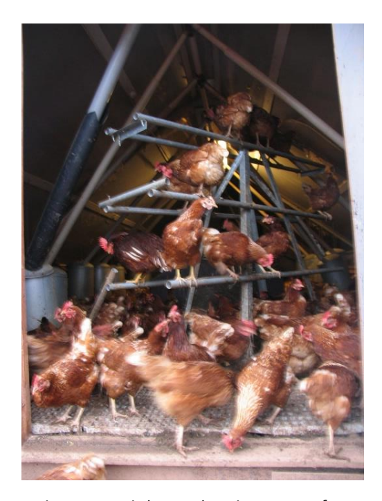
Figure 4: High perches in a cage-free system keep hens which are resting safely out of the reach of foraging hens below.

Foraging behaviour, scratching and searching, is rarely fully expressed in a cage<sup>38</sup>. There is no minimum space requirement in the legislation for a platform for foraging, so in practice this is often minimal, sometimes with no scratching mat provided. Even if there is a platform, only small quantities of substrate are provided and are rapidly depleted<sup>39</sup>.