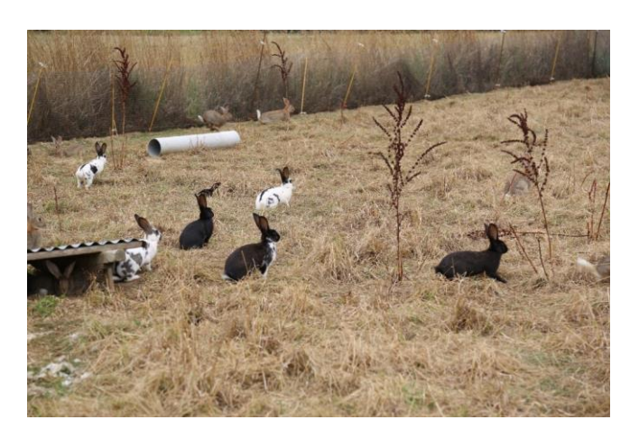
Figure 25: Free-range rabbit farm, France. Rabbits need space to exercise, to escape to a perceived safe distance; and shelters to hide in.

Rabbits are highly social animals, living in stable groups typically of between two and nine adult females (does), one to three adult males (bucks) and their offspring.227 Fights are rare because the group hierarchy is clearly defined.<sup>228</sup> They spend much of their time resting in groups in close contact other rabbits<sup>229</sup> and with strong relationships develop between specific individuals, who will choose to remain close to each other and rest together, often in body contact.<sup>230</sup> Mutual grooming is an important behaviour to reinforce social bonds.<sup>231</sup>