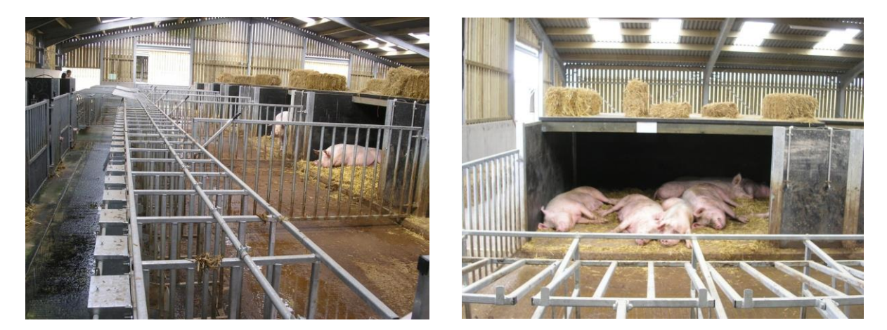
Figures 13 and 14: A group housing system for sows. Individual feeding stalls minimise stress and aggression. These are also used, very briefly, for insemination. Keeping sows in small, stable groups also reduces risk of aggression.

Good production results can be achieved with group housing from weaning and throughout gestation