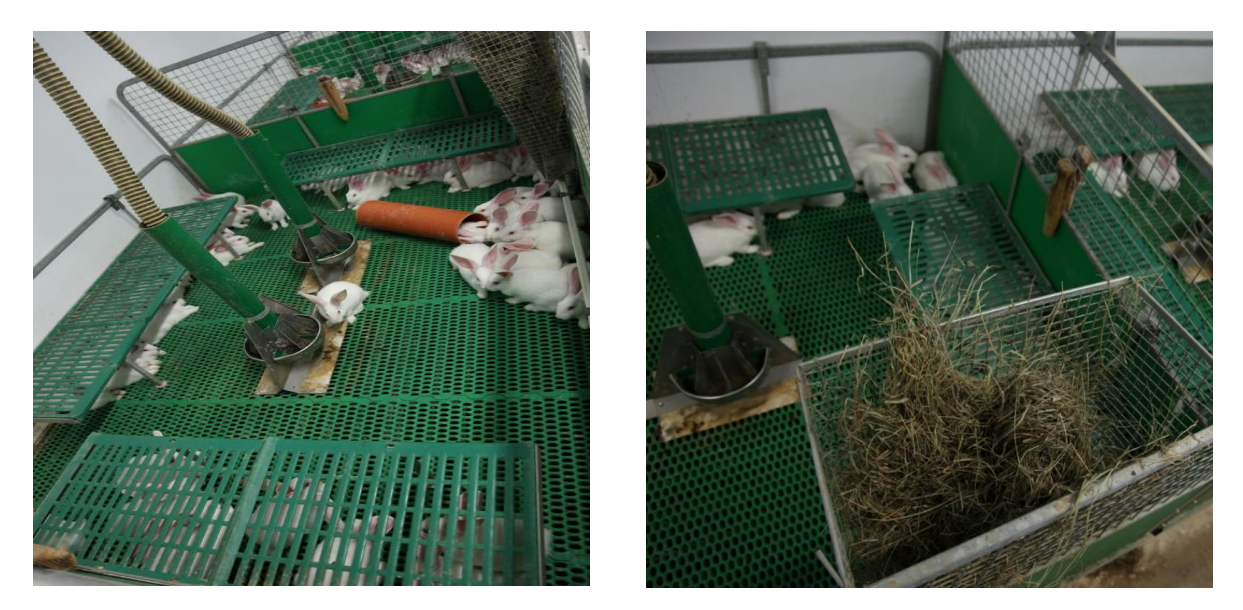
Figures 31 and 32: "Barn" system (large elevated pens), Germany. Includes platforms for vigilance behaviour, hiding spaces, hay-racks to provide fibrous food and space for some exercise.

Non-cage systems can provide greater functional space, elevated platforms for vigilance behaviours, opportunities for hiding and retreat (e.g. tubes, space underneath platforms, covered resting areas), and access to fibrous food and objects for gnawing. Some systems provide bedding material (usually straw), which provides for comfort and natural behaviour. Currently, the majority of commercial facilities avoid this to reduce disease risk and mortality.