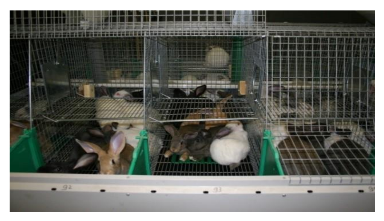
Figure 27: Enriched cage for growing rabbits. Has a platform for vigilance behaviour, but still no space to hide or exercise. Will become more crowded as the rabbits grow.