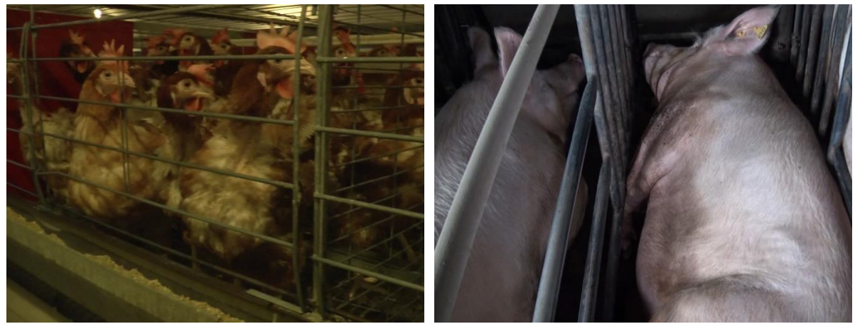
Figures 1 and 2: Lack of space in a cage severely restricts even the most basic natural behaviours