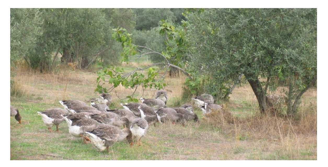
Figure 40: Geese on the commercial farm of Pateria de Sousa feeding on grass, supplemented by figs and olives, from the orchard. Other flocks of their geese feed on acorns on the Extramaduran Dehesa, making this a highly sustainable system.

Geese, though not ducks, will naturally produce fattier livers in time for migration<sup>369</sup>. One example is the Pateria de Sousa farm in Southern Spain, where free-living geese feed naturally on carbohydrate-rich food as winter approaches, developing fattier livers naturally. Their livers grow to 450-500g.<sup>370</sup> This compares with 600-1000g for a force-fed bird<sup>371 372</sup>.