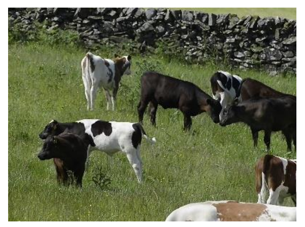
Figure 44: Calves performing social play.