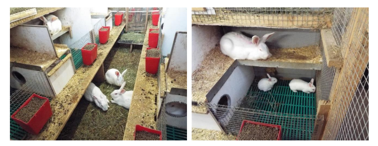
Figures 36 and 37: Group housing system for breeding does, Kani-Swiss GmbH, Switzerland. Does are kept in enriched pen (left) from 2 days before giving birth until 12 days after. After this they have access to the group pen. Kits are free to join the group at 18 days, and are returned at night to ensure they are fed by their mother. The system achieves very low mortality rates for both does and growing rabbits.<sup>1</sup>

and provided with sufficient space, adequate nesting facilities and environmental complexity.<sup>302</sup> Alternatively, does can be provided with the opportunity to move between a communal area and their own secluded area which only they can access (by means of an electronic recognition system via a transponder in the ear tag). This may provide a means to largely eliminate injuries due to aggression by allowing does to choose when they wish to be in a group and when they wish to be on their own.<sup>303</sup>